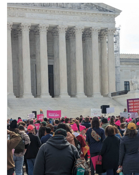
ACLU-DE STAFF AND BOARD WERE PRESENT AT THE RECENT MARCH 26 SUPREME COURT RALLY IN SUPPORT OF ABORTION CARE.

It is time for us all – citizens, advocates, and lawmakers – to get involved and work together to fund and pass HS 1 for HB 110.