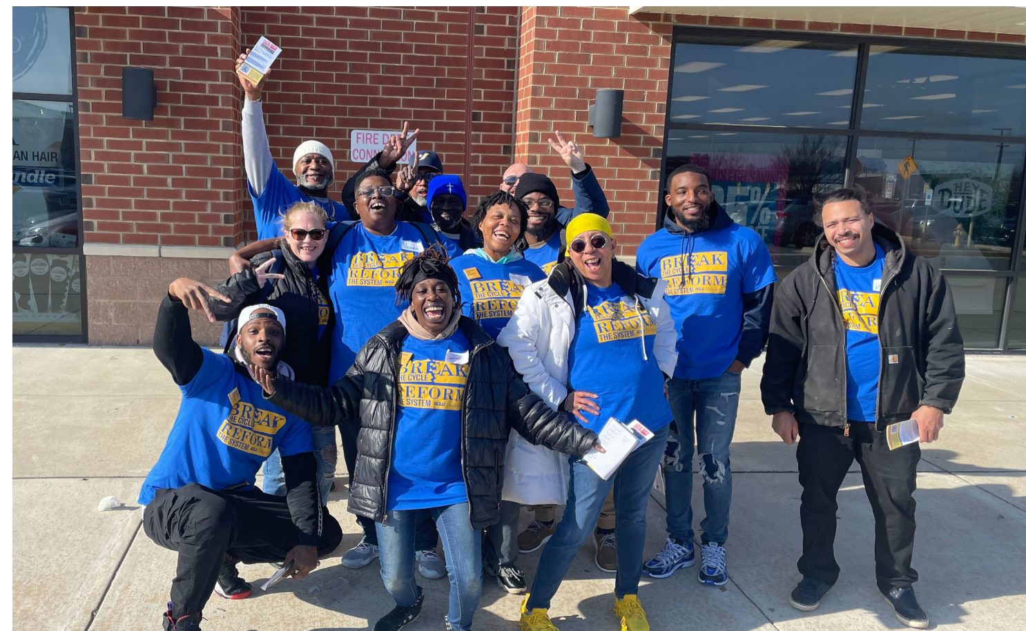
OUR SMART JUSTICE AMBASSADORS SHOW UP YEAR AFTER YEAR TO HELP US RAISE VITAL FUNDING FOR JUSTICE REFORM!